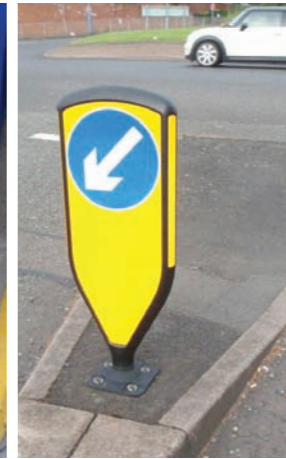
Conspicuity is guaranteed with 3Sixty.