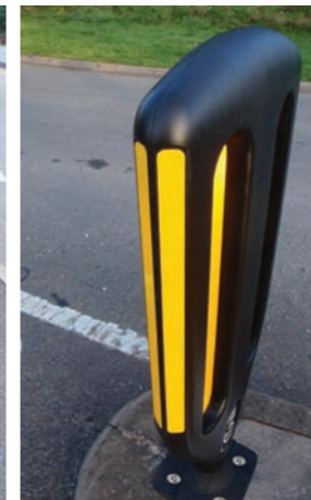
Reflective side panels are angled to assist vehicles turning into junctions