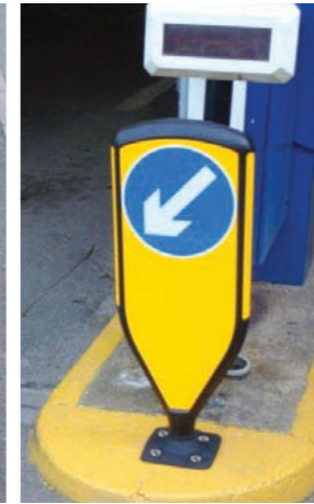
Although specifically designed for Pedestrian Islands the bollard is suitable for numerous sites where traffic control is necessary.