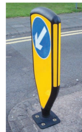
Value engineered for a highly competitive price without effecting quality or performance.