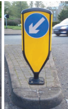
3Sixty has a slim but aesthetically designed appearance