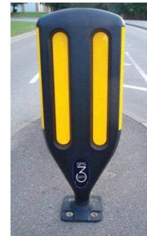
Rear reflective panels come as standard.