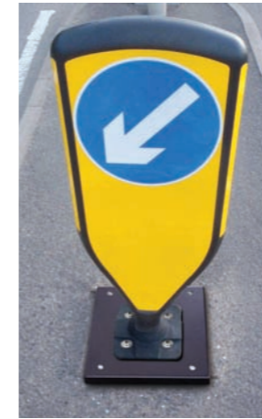
3Sixty can easily be adapted to fit redundant base lights