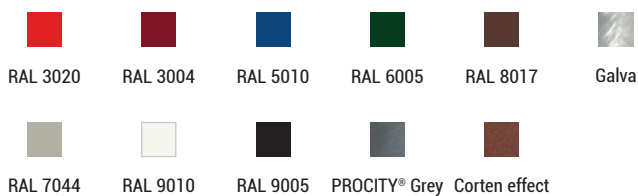
Code 529451 + 529455