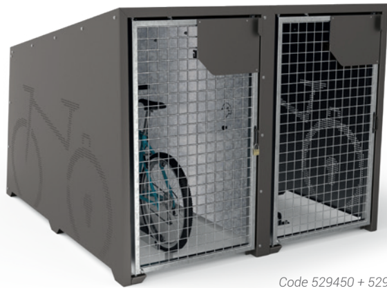
Code 529450 + 529454 + 529455